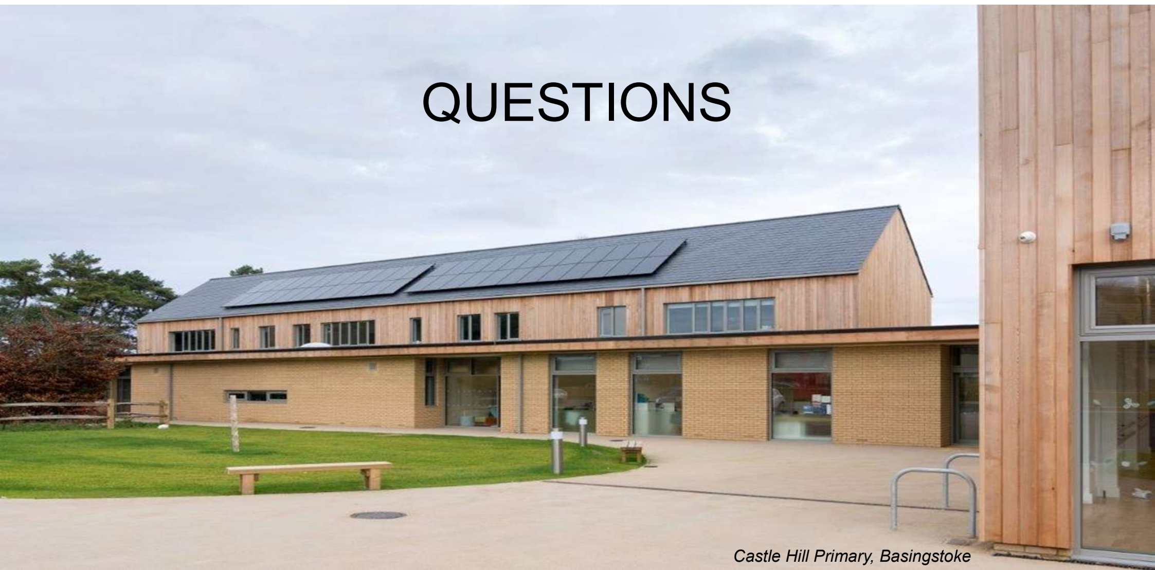
Castle Hill Primary, Basingstoke