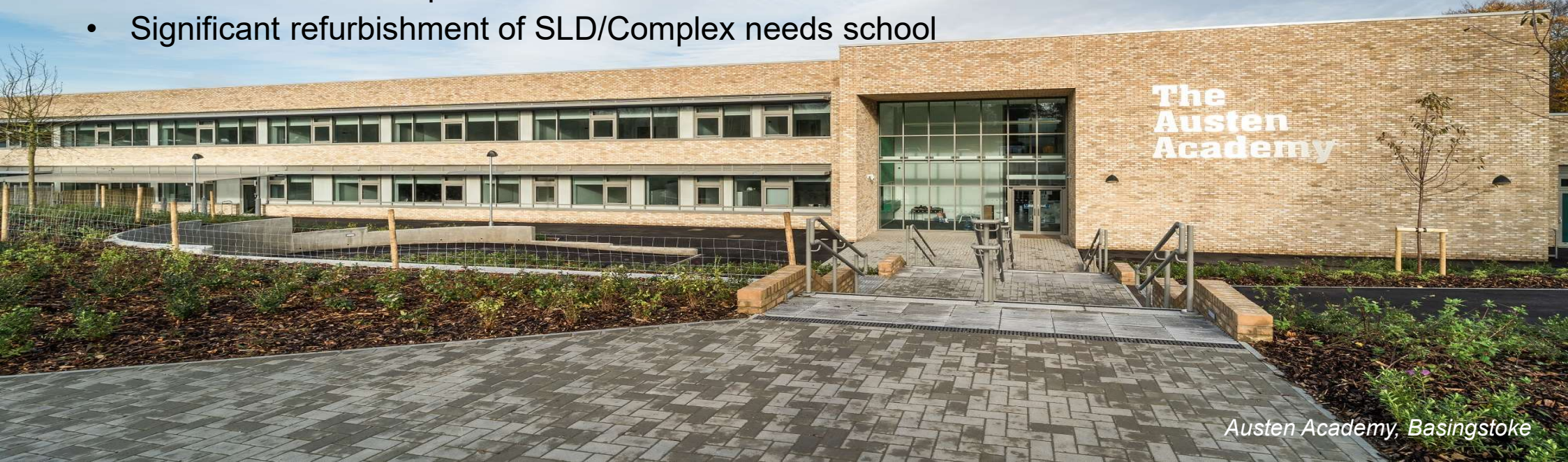
Austen Academy, Basingstoke