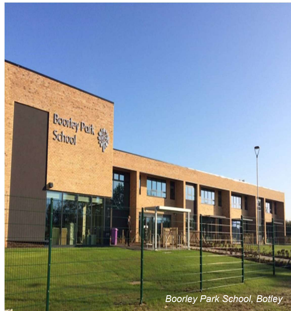
Boorley Park School, Botley